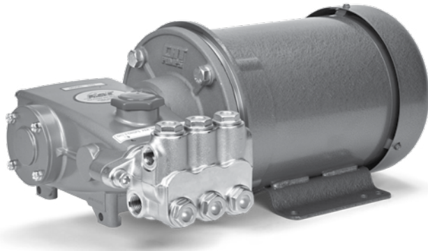
Model 340BD33 Shown

Used on Pump Models: 340, 341, 347, 350, 351, 357